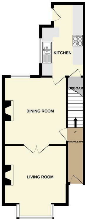
GROUND FLOOR 500 sq.ft. (46.5 sq.m.) approx.